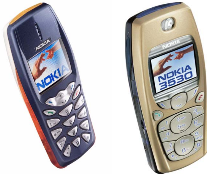
Figure 1: Transceiver RH-9

The RH-9 is a dual band transceiver unit designed for the EGSM and GSM1800 networks. It is both a GSM900 phase 2 power class 4 transceiver and a GSM1800 power class 1 (1W) transceiver.